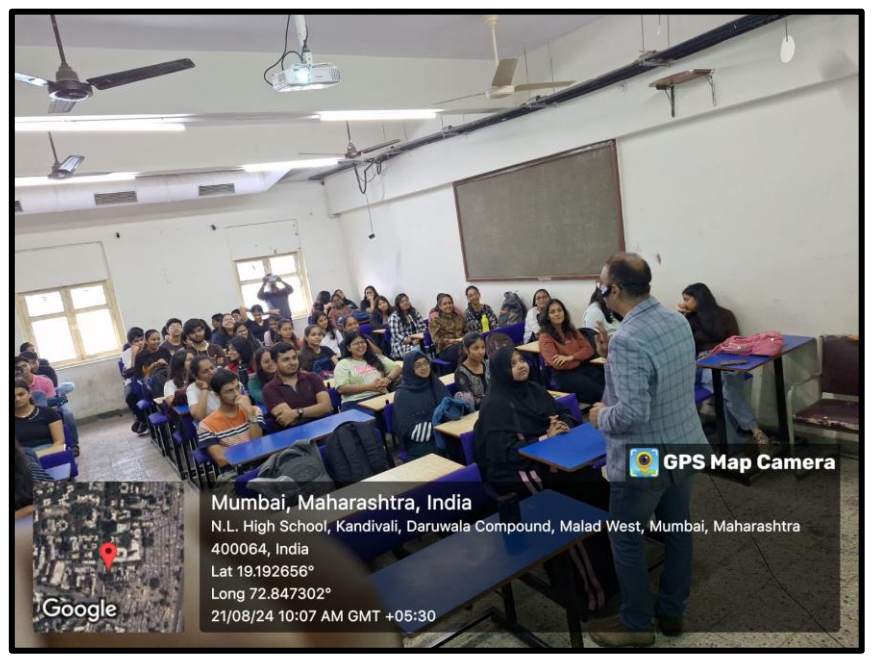
"Engaged and absorbing every word"