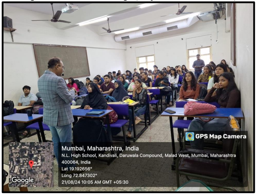
"Empowering your journey with insight and inspiration"