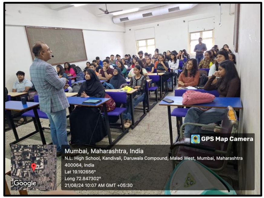
"Future-Proof Your Career: Insights from Experts on Banking and Finance"