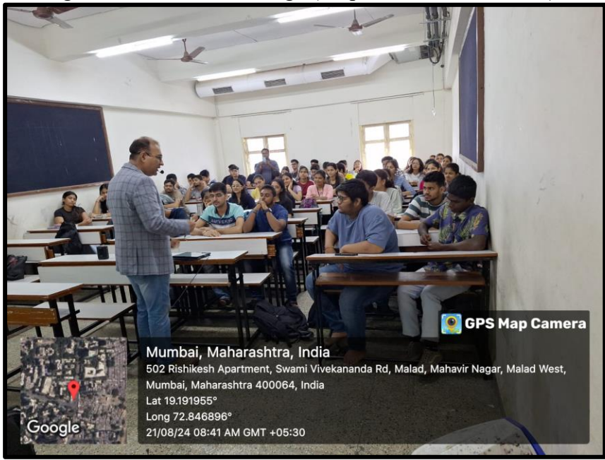
"Unlock your banking potential"