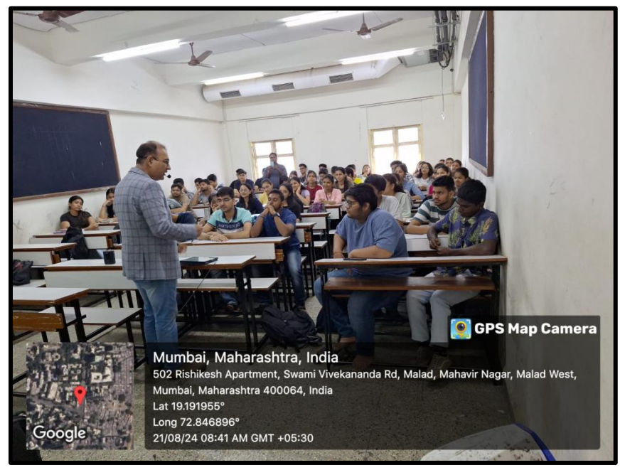
"Turning aspirations into achievements"